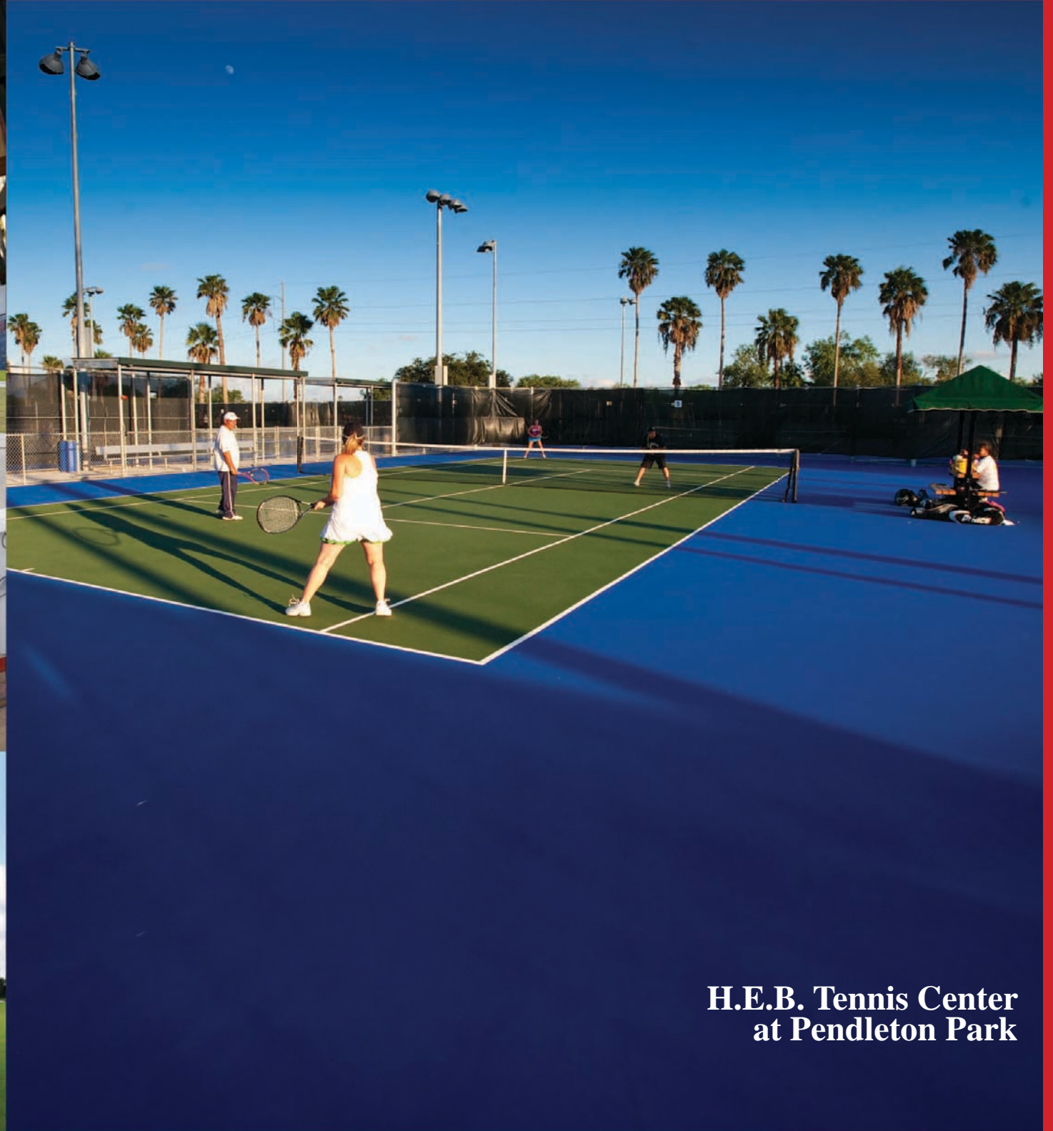
H.E.B. Tennis Center at Pendleton Park