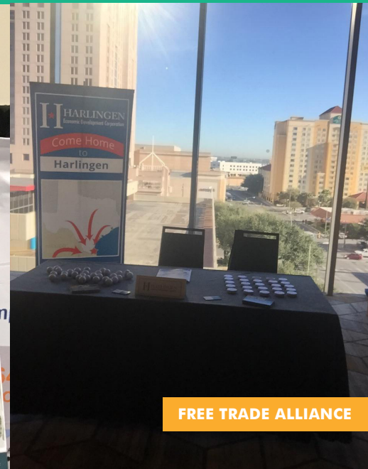
FREE TRADE ALLIANCE