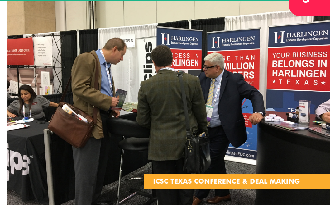
ICSC TEXAS CONFERENCE & DEAL MAKING